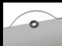
Calendar with hanger ...