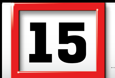
..... Date cursor and numbers in original size.