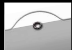
Calendar with hanger ...

Thereby, the transparent carrier film for the date cursor is slightly coloured, harmoniously coordinated with the colour of the previous and following months of your advertising calendar.