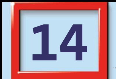
Date cursor and numbers in original size.